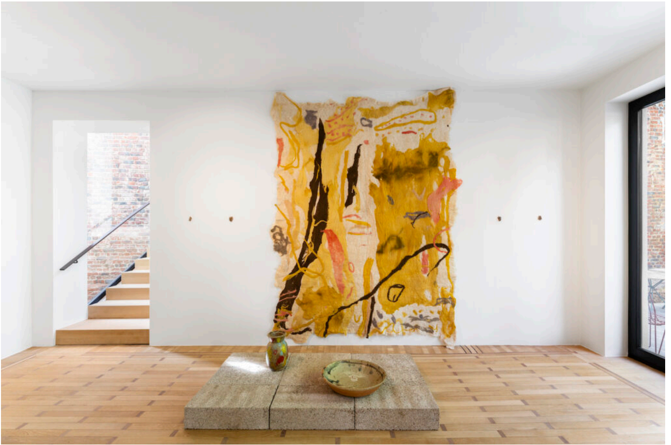
Regenerative Futures at the Fondation Thalie, © Hugard & Vanoverschelde