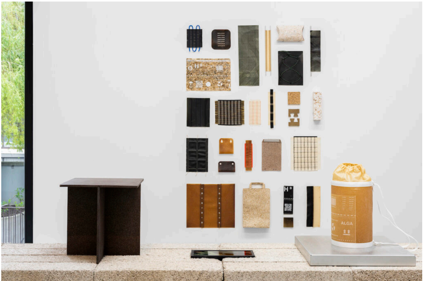
Regenerative Futures at the Fondation Thalie, © Hugard & Vanoverschelde