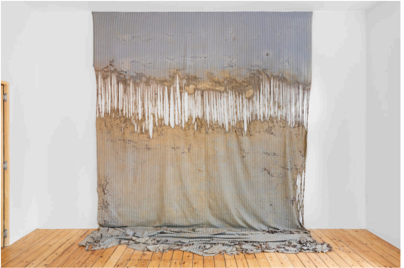
Regenerative Futures at the Fondation Thalie, © Hugard & Vanoverschelde