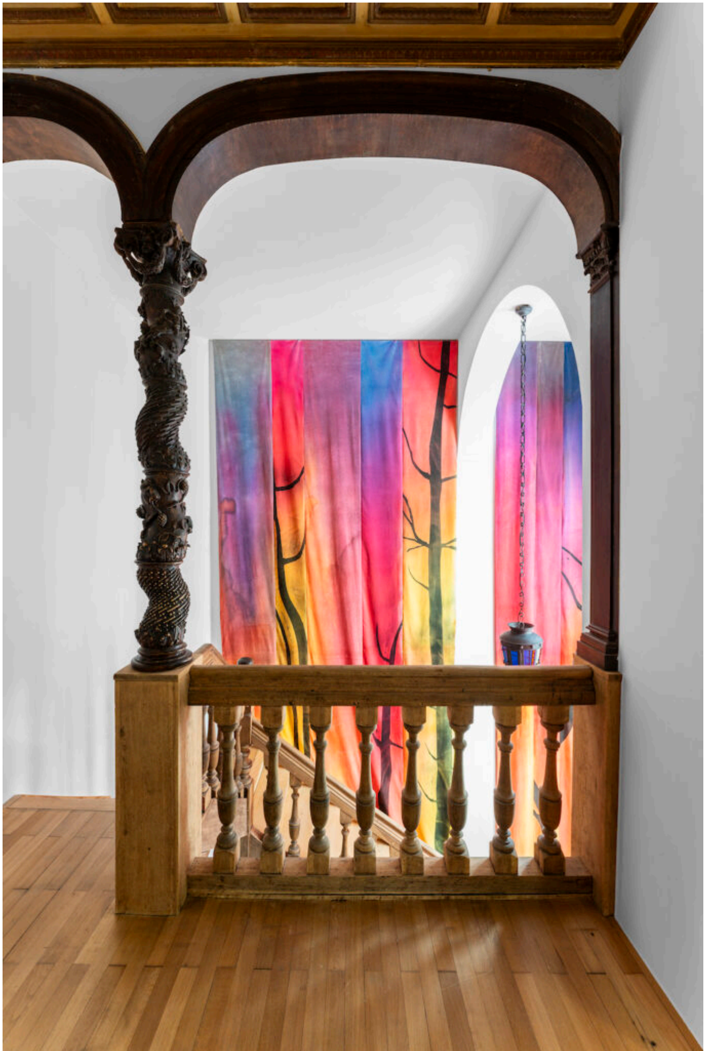
Regenerative Futures at the Fondation Thalie