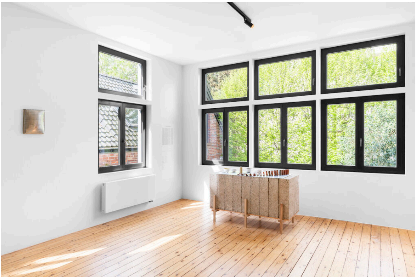
Regenerative Futures at the Fondation Thalie