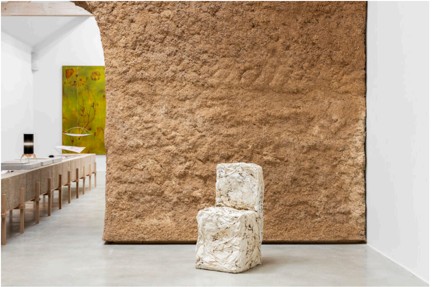
Regenerative Futures at the Fondation Thalie, © Hugard & Vanoverschelde